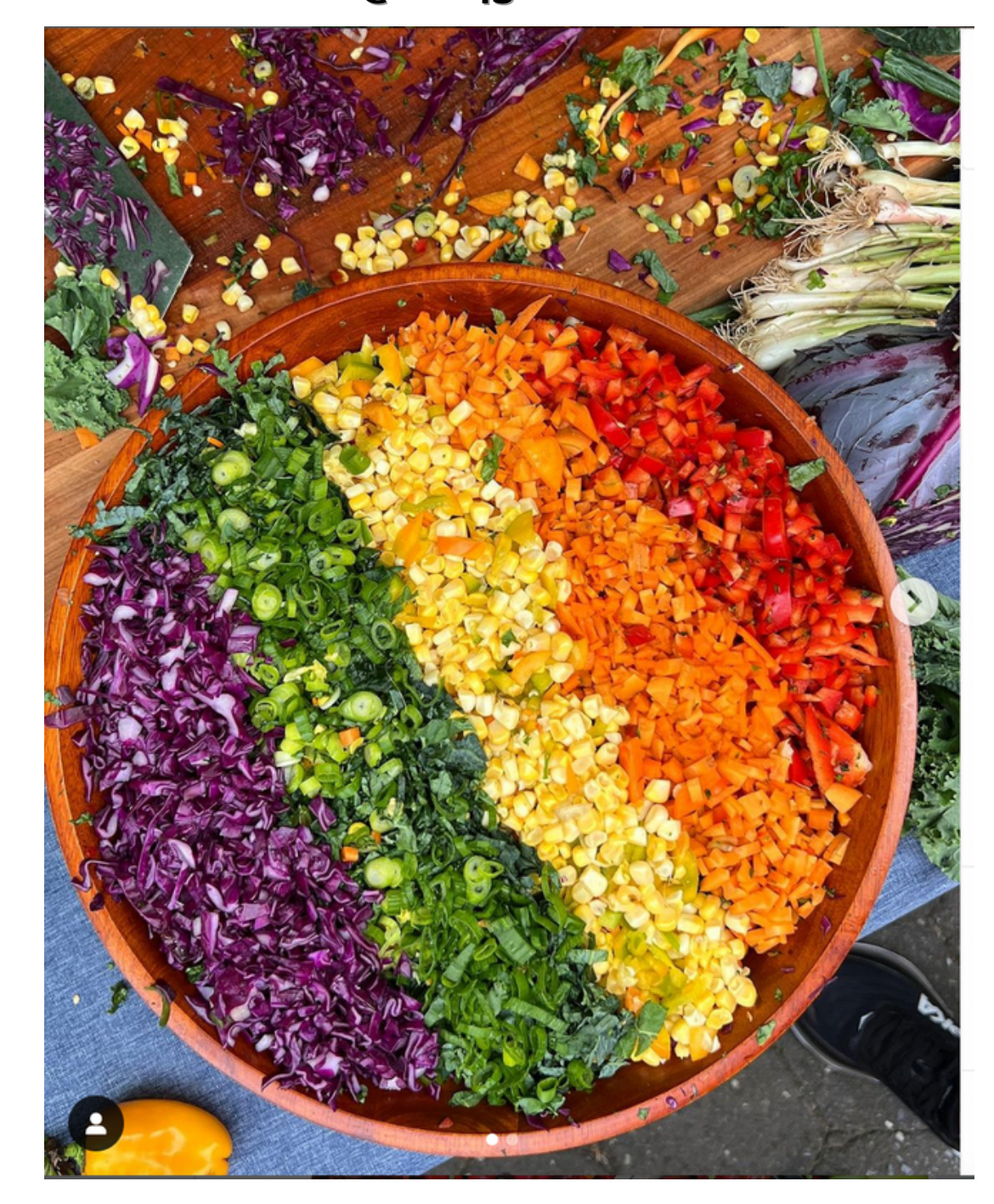
Bright colors, eye.catching

Union Square Green Market @unsqgreenmarket