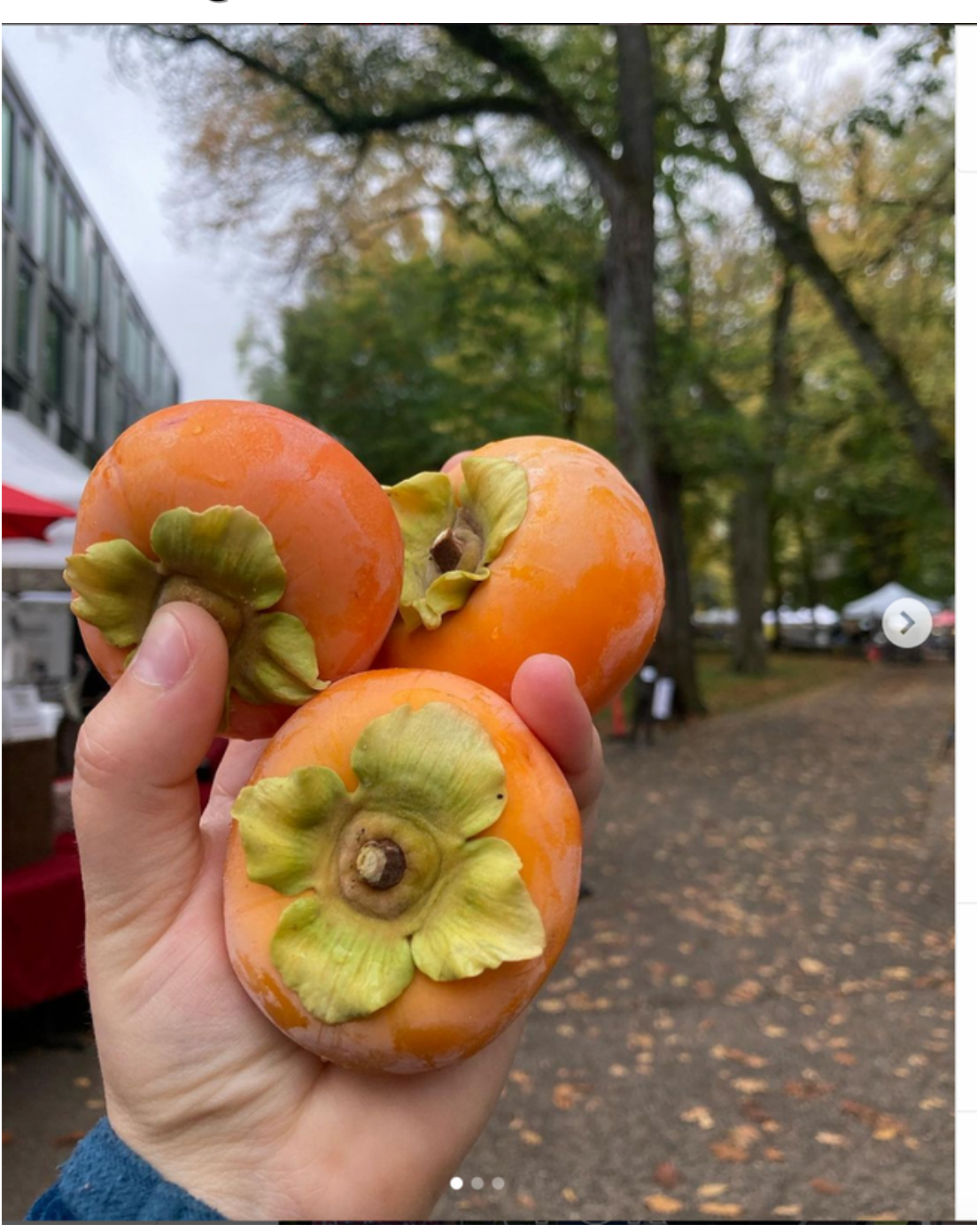
High-quality shot. Clarity.

RVA's Black Farmers Market @rvablackfarmersmarket