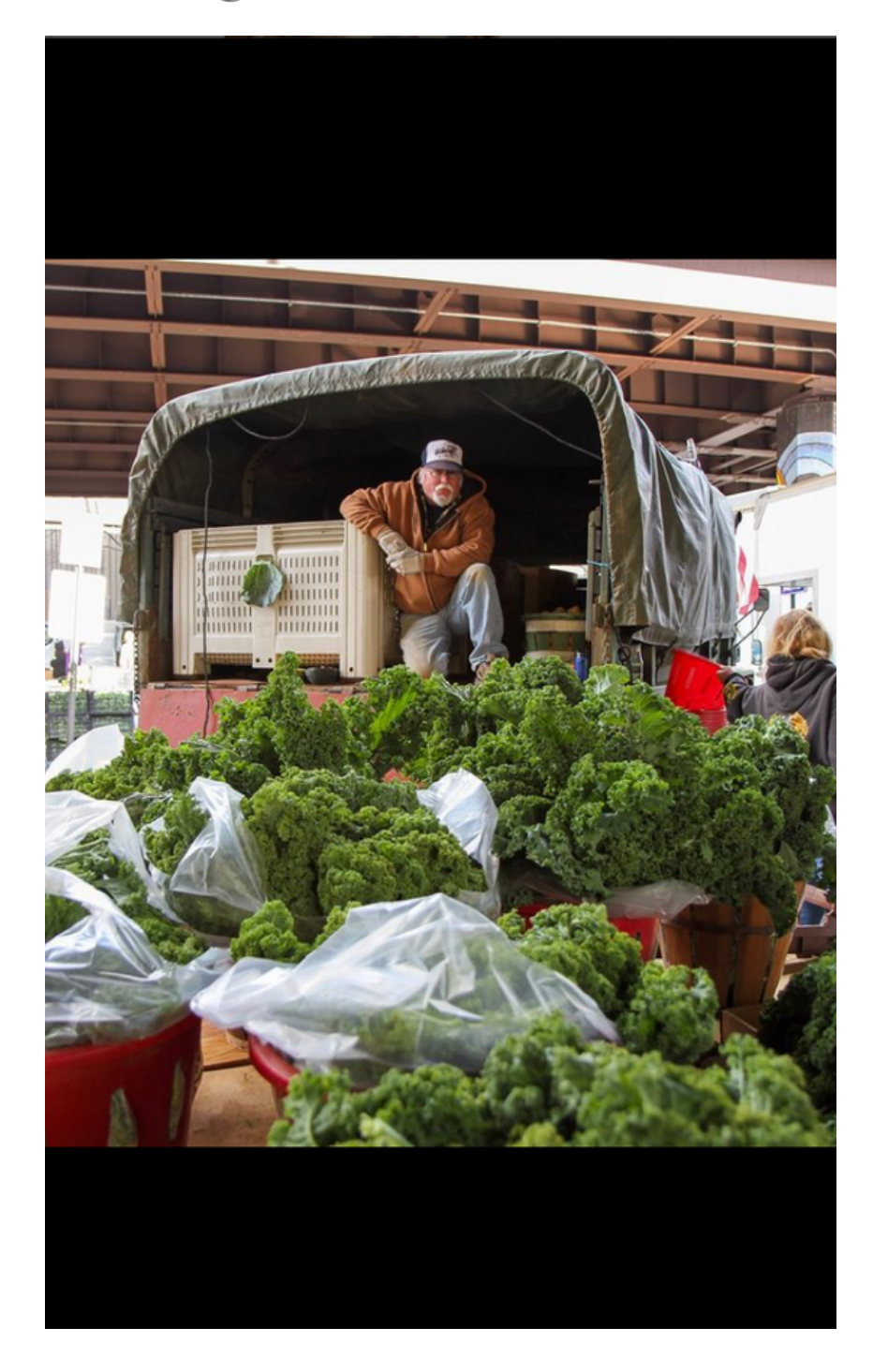
Share photos of produce vendors unloading for set up!

RVA's Black Farmers Market @rvablackfarmersmarket